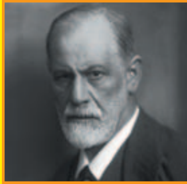
World famous psychiatrist Dr. Sigmund Freud