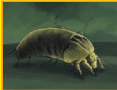
Eriophyidae Mite, 125 microns The smallest animal in the world